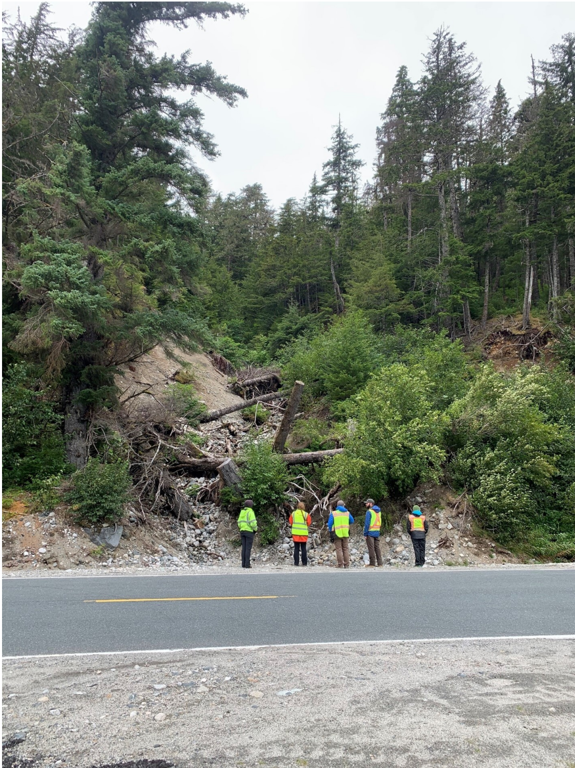
Project Team inspecting storm damage off of Lutak Rd

See previous Haines community updates at the DOT&PF 2020 Storm Recovery Program website .