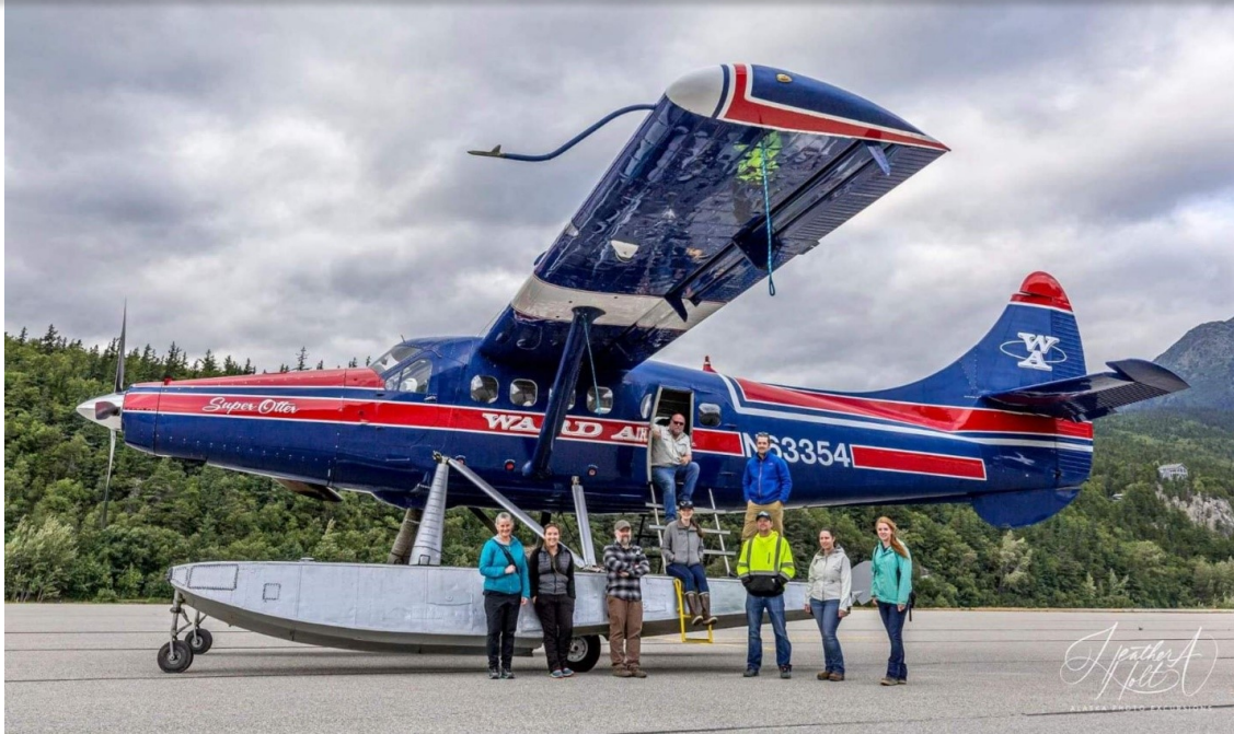
Project team heading out for site visits.